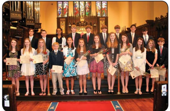
Selected 7th and 8th graders were inducted into the Honor Society this spring.