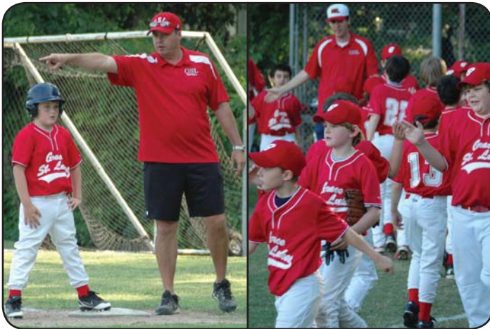
GSL Coaches hard at work