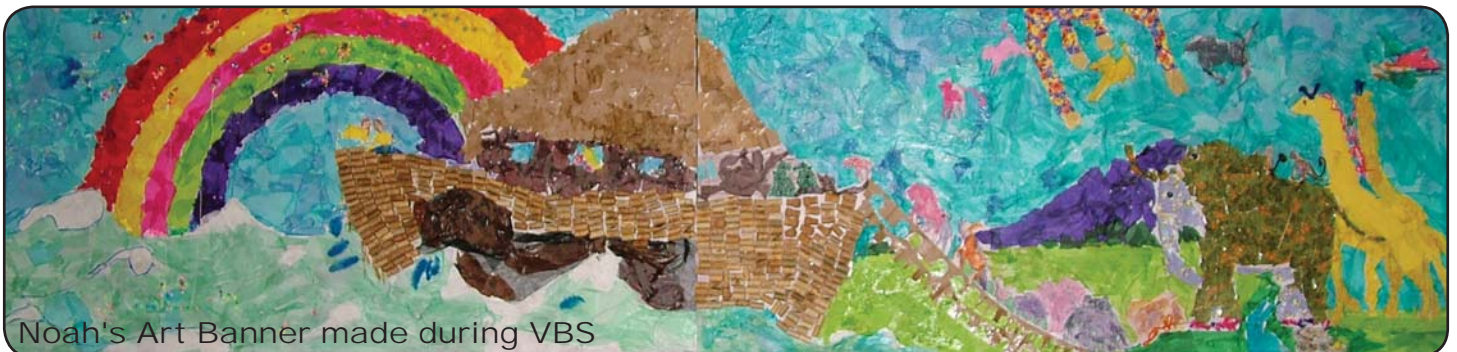
Noah's Art Banner made during VBS

If you'd like to catch a glimpse of the fun in photos and a few videos, go to GSL's flickr site at www.flickr.com/photos/gracestlukes/sets/72157626900620662/ .