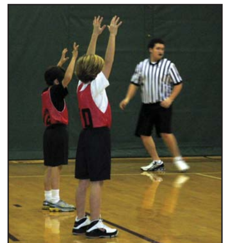
GSL Church Basketball teams enjoy playing ball!