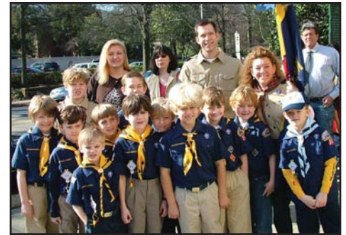
Cub Scout Pack 34