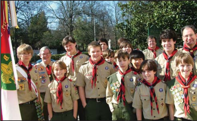
Boy Scout Troop 34