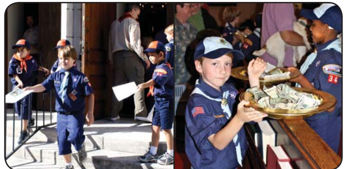
GSL Pack 34 Cub Scouts hand out leaflets and take up the offering for the Pet Blessing service.