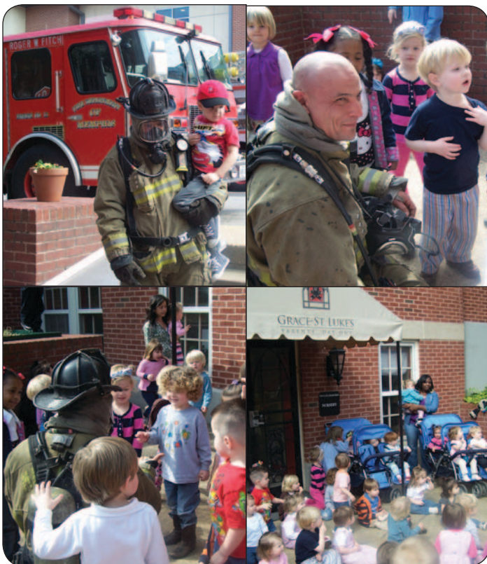
Memphis firemen came to teach GSL Parents' Day Out children all about fire safety and talked about how firefighters help us.